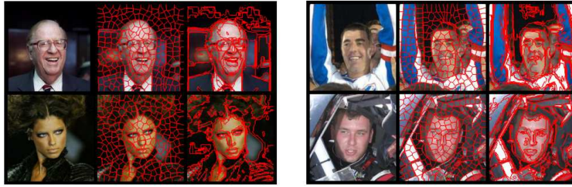
Fig. 3. Examples of superpixels. The left column is the original image, the middle column is the Mori segmentation ( N_{sp}=100 , N_{sp2}=200 , N_{ev}=40 ), and the right column is the Felzenszwalb-Huttenlocher segmentation ( \sigma=0.5 , K=100 , \min=20 ).

Alignment. To create an aligned version of our database, we used an implementation of the congealing and funneling method of Huang et al. [12]. 7 We took one image each of 800 people selected at random to learn a sequence of distribution fields, which we then used to funnel every image in the database.