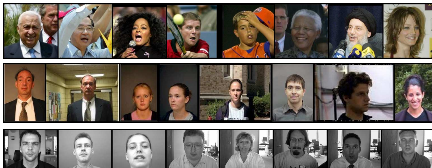
Fig. 1. Sample images from LFW (first row), FRGC (second row), and BioID (third row), representative of variation within each database ( best viewed in color )