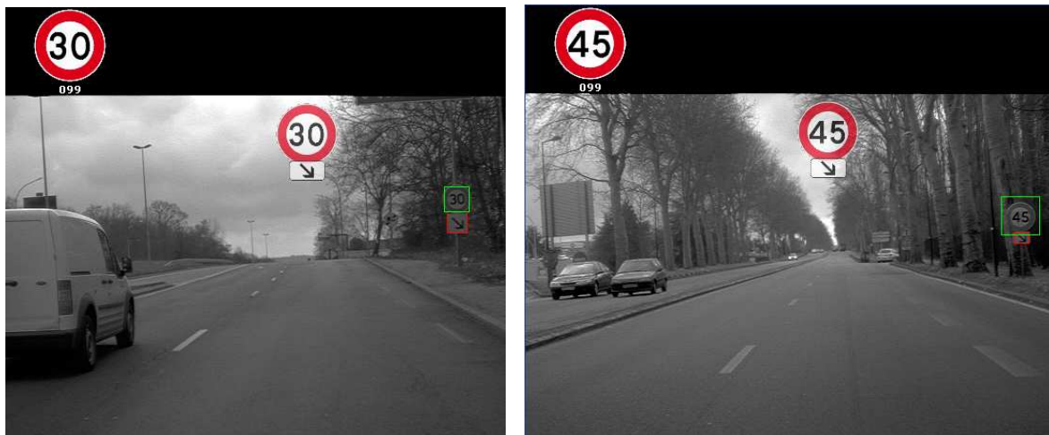
Fig. 4. Illustration of correct detection and recognition of square and big (left) as well as rectangular and small (right) French exit-lane supplementary signs