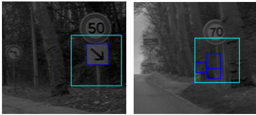
Fig. 3. Illustration of research zone below recognized speed-limit signs, and of rectangle-detection inside: on the left, a supplementary sign is detected, on the right spurious rectangles are detected but shall be eliminated by recognition step

As a first test, we focused on French exit-lane supplementary signs, which exist in various “flavours”, some of them square, and others with rectangular shape. We decided that the most convenient way to deal with that was to systematically resize the potential supplementary sign to a common (experimentally chosen) 12x12 square size. The classifier itself is a MLP neural network with 12 \times 12 = 144 inputs, and only 1 output neurons designed to output +1 for all positive examples of exit-lane supplementary signs and -1 for any other image. The hidden layer size was set to 10 neurons, by comparing, on validation set, correct classification rates for several hidden layer sizes. A first evaluation was done on a set of recorded French videos containing 50 speed-limit signs, among which 18 with an exit-lane supplementary sign below. The results obtained are illustrated on figure 4, and quantified in table 2. The correct detection rate of 78% is already quite satisfactory for a first implementation, and further improvement to increase precision by collecting more negative examples is underway.