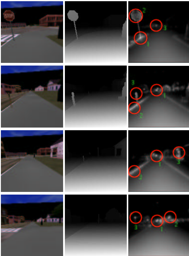
Fig. 4. Different saliency maps obtained during the wandering. First column shows the corresponding subjective view, second column shows the depth buffer and the last column is the saliency map with the location of three fixations

puter graphics problematic. While other approaches didn't take into account the properties of the human visual perception system, we have proposed a way to simulate in a more accurate way humanoids evolving into virtual environments. Information used in the image analysis process are of a new type (depth information for instance), and we think that such an application can be of use to improve attention selection models. One of the most important problems lies in the validation of our model regarding to simulation. Processing computer rendered images has revealed to depend on the quality of the rendering step. In our next work, we intend to apply this technique on photo-realistic rendered images of existing environments, and compare our results with real ones. Moreover, improvements can also be performed in the definition of the saliency map, notably thanks to the addition of other types of feature maps. Considering the temporal aspects, it seems to be of need to add a top-down attention selection process (based on memory) that can come up with the redundancy problem existing be-