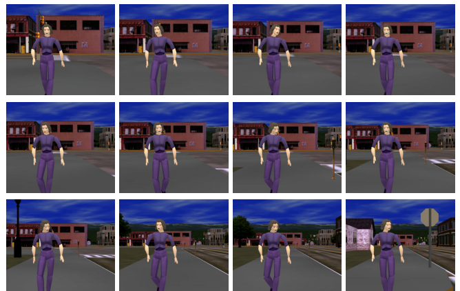
Fig. 3. Snapshots of the animation where our virtual characters walks along the sidewalk

We have tested our system on a virtual character wandering along the street into a virtual city. This animation was generated in real-time on SGI330 Linux PC, under our animation and simulation framework. Figure 4 show different salient maps computed along his path. Considering the Gabor filtering part, 8 orientations and 4 scales were used. A special thread was designed to compute those maps, and the time elapsed during its execution was around 100 ms, which is less than the time needed to gaze at the different conspicuous zones. One can observe that most of the important objects are detected : traffic signs, houses, sidewalks. Hence, at the end of the animation, our humanoid had looked at many different locations. In comparison, a traditional animation system would have required to set in the environment some predefined targets, which presupposes pieces of knowledge about the environment. The model of saliency map we designed is rather simple, and could be enhanced with other types of feature maps. Meanwhile, the resulting animation is quite interesting in the sense that it gives to our