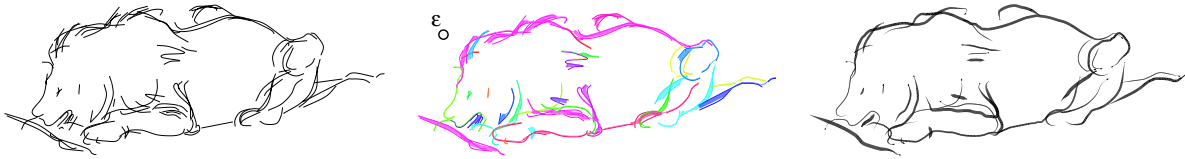
Figure 1: Lines of the initial drawing (left) are first automatically clustered into groups that can be merged at a scale \epsilon (middle). A new line is then generated for each group in an application-dependent style (at right, line thickness indicates the mean thickness of the cluster).