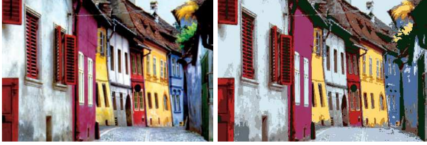
Figure 3: Distance-based mean-shift followed by k -Means clustering on the point cloud made of LUV colors of the pixels of the picture on the right.