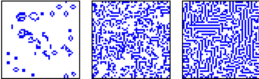
Figure 1: Three snapshots showing evolutions of Life for a random initial configuration : (left) synchronous updating t = 200 , (middle) \alpha -asynchronous updating with \alpha = 0.5 , t = 400 , (right) fully asynchronous updating t = 200 .

behaviour rich enough to embed a universal Turing machine [BCG82]. Now what happens to the system if the cells are no longer updated synchronously at each time step ? There are various methods for defining asynchronous systems and we will here restrict our scope to the two most intuitive ways: (a) we call \alpha -asynchronous updating the procedure which consists in updating a cell with probability \alpha at each time step, otherwise keeping its state constant; (b) we call fully asynchronous updating the procedure where cells are updated sequentially and where the cells to update are chosen randomly and independently without any memory.