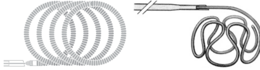
Fig. 1. Example of coils used in our simulations, left: Boston Scientific helical coil GDC 10, right: 3D GDC built with omega loops [13]

for the stick and slip transitions that take place during the deployment of the coil. The model also includes a compliant behavior of vessel wall that is close to Boussinesq model [14]. For modeling contacts with friction, we use two different laws, that are based on the contact force and on the relative motion between the coil and the aneurysm wall. The contact law is defined along the normal \mathbf{n} and the friction law, along the tangential (\mathbf{t}, \mathbf{s}) space of the contact.