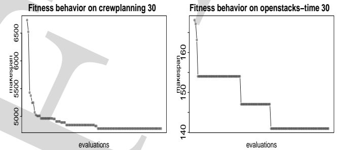
Figure 2: Fitness behavior of DAE_{YAHSP} on crew planning 30 and openstacks simple time 30 .