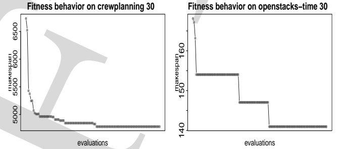
Figure 2: Fitness behavior of DAE_{YAHSP} on crew planning 30 and openstacks simple time 30 .