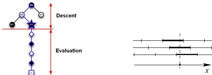
Fig. 1. Left. Illustration of the Monte Carlo Tree Search algorithm from a presentation of Sylvain Gelly. Right. Illustration of 3 overlapping tilings from the article [9].

The construction of the tree is done by the repetition while there is some time left of 3 successive steps: descent , evaluation , growth .