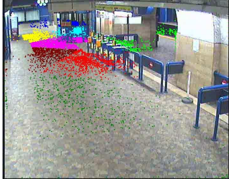
Fig 3. Clustering results for 8 lost zones. Each colour represents a cluster.