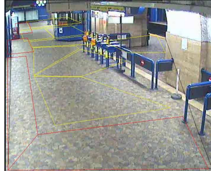
Fig 4. The yellow polygons show the outline of the learned lost zones. The red polygons show the outline of the entry zone, exit zone and IO zones.