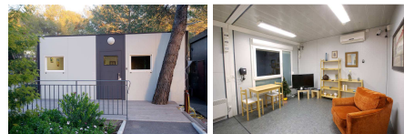
Figure 1 Gerhome laboratory pictures