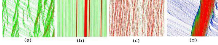
Fig. 1: Spatio-temporal plots for multi-speed exclusion process with 2 speed levels (a) (b) and (c) and with 3 speed levels (d). Time is going downward and particles to the right. red, green and blue represent different speeds in increasing order. The size of the system is 3000 except for (b) where it is 100000. Setting are \lambda_a = 100 , \lambda_b = 10 , \gamma_a = 100 , \delta_b = 2 for (a) and (b) and \delta_b = 10 for (c), all with density \rho = 0.2 . In (d) the rates are \lambda_c = 10 , \lambda_b = 100 and \lambda_a = 200 , \delta_c = 3 , \delta_b = 5 , \gamma_b = 0.1 and \gamma_a = 1 with \rho = 0.3 .

governing the evolution of the probability distribution P(\mathcal{C}, t) with time: