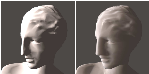
Figure 1: Marble statue without (left) and with (right) subsurface scattering.