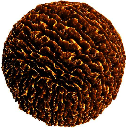
Fig.15. Mapping of 96 texels on a sphere.