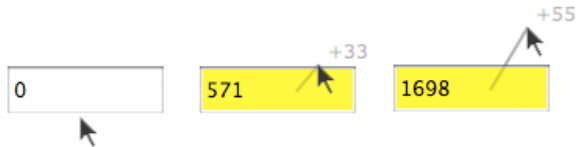
Figure 5: A joystick style of interaction for text entry.

One problem with the above implementation is the lack of an ink trail. SwingStates can attach a state machine to the glasspane , a feature of Swing that creates an overlay plane above the widgets in a window, in order to draw the ink and erase it when the pen is up. Fig. 5 shows another example that uses the glasspane to enter a numeric value in an entry field using a joystick-like interaction.