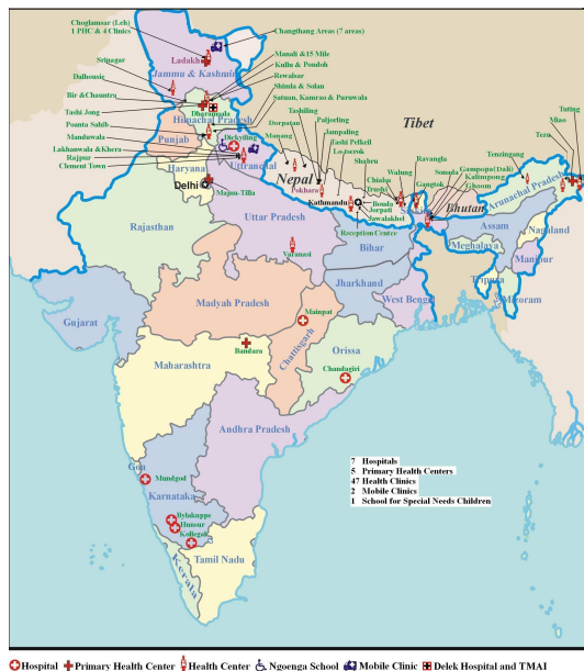
Figure 2: SMS-MobileWeb Information Flow