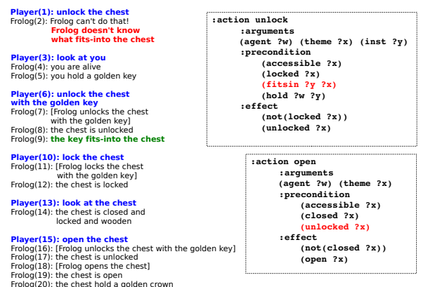
Figure 2: External bridging becomes internal

This means that, when an action is executed, the interaction KB will be updated not only with the effects of the action but also with its preconditions. And those preconditions that were not in the interaction KB before will be verbalized as in turn (9) in Figure 2.