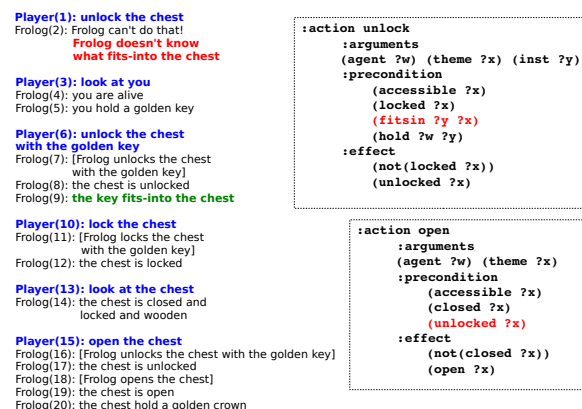
Figure 2: External bridging becomes internal

This means that, when an action is executed, the interaction KB will be updated not only with the effects of the action but also with its preconditions. And those preconditions that were not in the interaction KB before will be verbalized as in turn (9) in Figure 2.