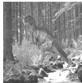
Figure 3: A 3D object in front of cluttered background.

Experiments first show that the recognition rate increases for the test set of 100 aerial images (taken from