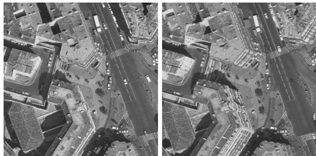
Figure 2: The left image shows an image of the test set; the right one is the corresponding image of the database. Notice that buildings appear differently because viewing angles have changed and cars have moved (courtesy of Istar).

The test set consists of 100 aerial images taken from a different point of view. The left image of figure 2 shows an image of the test set and the right image is the corresponding image of the database. Notice that buildings appear differently because viewing angles have changed and cars have moved. Another test