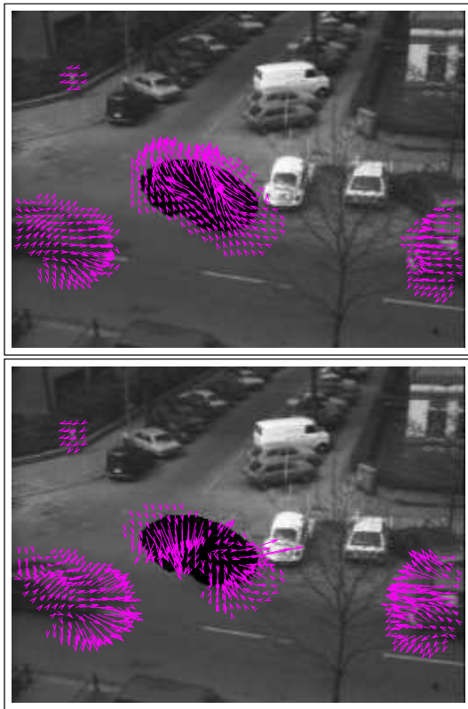
Figure 2: Missing data: D.A. (top), H.&S. (bottom).