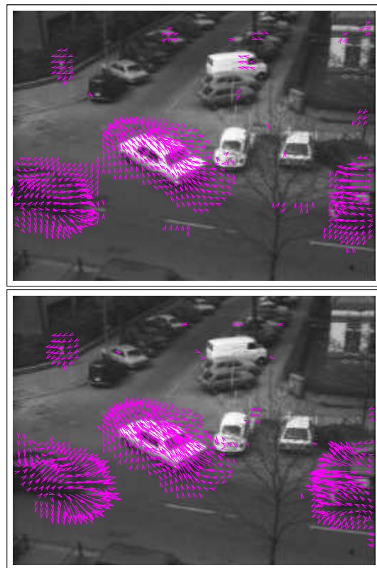
Figure 3: Result with gradients set to zero on frame 5 (top) and with gradient available (bottom).

H.&S. method is no more able to provide any result in that case, conducting to a discontinuity in the output.