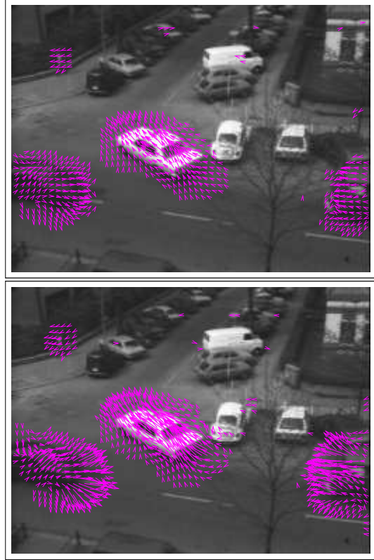
Figure 1: Result on frame 5: D.A. (top), H&S (bottom).

In a first experiment, we compute the optical flow on the sequence using the Data Assimilation method (D.A.). The Horn & Schunk method (H.&S.) is also applied and results, on the fifth frame, are displayed