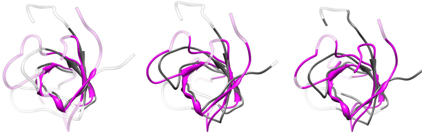
Fig. 3 Alignment of 1aawA (gray) and 1gxiE (pink), an instance of the Sisy set. Optimal superposition according to the respective alignment. Residues colored in dark tone are aligned, residues colored in light tone are unaligned. Left: The Sisy reference alignment (29 aligned residues, RMSD of 1.14). Middle: The heuristic DALI alignment correctly aligns all residues of the reference alignment, but extends the alignment length to 50 (RMSD of 2.55). Right: The optimal CMO alignment; it correctly aligns 96.55% of the aligned residues of the reference alignment. Alignment length is 56, RMSD 4.25. Additional gaps are inserted. Overaligning and insertion of additional gaps leads to a low RMSD value.

For global alignments of structurally very similar proteins, e.g. , Skolnick instances, the shift from a simple scoring function like CMO, to a more sophisticated scoring of all distances using for example the DALI scoring function, shows little effect. Nonetheless, our previous evaluation of the complete Sisy data set illustrates that for detection of more complex structural similarities, basic scores as CMO are not always sufficient to obtain gold-standard reference alignments, and the DALI scoring function performs on average better [23].