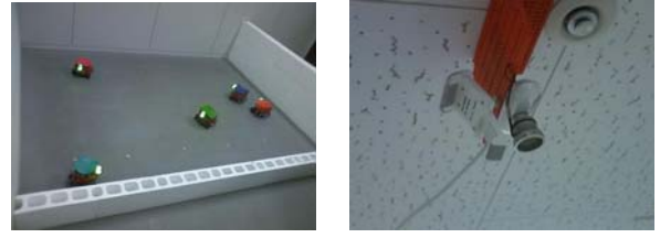
Fig. 3. Field (left) and the USB camera on the ceiling (right) of the environment of the experiments. For the field, the top leftmost corner is the origin; and x and y axes are along the thermocol blocks and the wall, respectively.