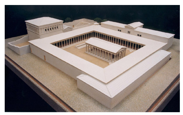
Figure 1: Left: A view of the remains of the Hellenistic Asklepieion of Messene in Greece as they are today. Right: A full reconstruction as a 3D plaster model.

with a variety of interfaces, which are located in research and public spaces around Europe. The preliminary prototype currently runs transparently on a PC/Linux-driven immersive workbench and an SGI/IRIX-driven RealityCenter ^{TM} using an Onyx4.