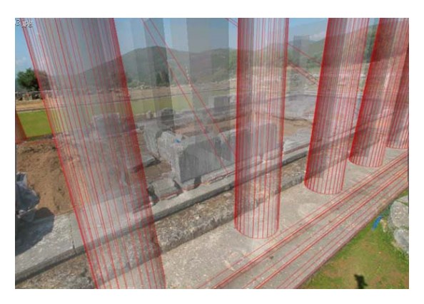
Figure 2: Additional modelling of virtual elements is performed in order to complete the reconstruction of the site and bring it to the form that it once had.

In order to achieve simulations with a high degree of realism, we have chosen to create photorealistic models by capturing images of real scenes constructing 3D models with a modelling-from-images technique <sup>4</sup>. The resulting 3D models are then further enhanced with additional modelling to correct possible errors and complete the site by bringing it to a form that it once had, but keeping the surrounding environment in its current condition (Figure 2). Dynamic behaviour is then added to the models with which the user will interact, as specified by the usage scenario for each case. To achieve realism without sacrificing performance, we are adapting fast display techniques for complex geometry, consistent and realistic lighting, and natural elements (vegetation etc.) to a real-time context.