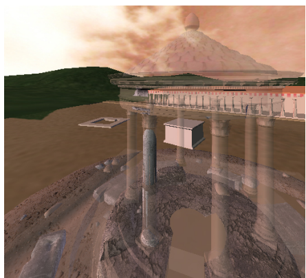
Figure 9: Right: the monument with fragments. Left: the fragments placed in their correct positions.

grain metaphor to a stereo viewing context. The metaphor evidently breaks down since paper is a fundamentally 2D medium; the goal is not to reproduce paper in a 3D/stereo context, but simply to maintain an equivalent aesthetic result within a stereo viewing context.