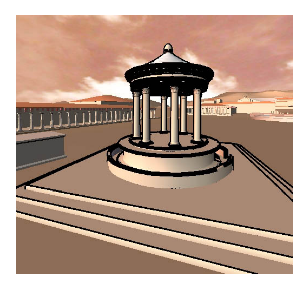
Figure 10: An example "pen-and-ink" style rendering of the Tholos monument in our VR system.

by specialists into engaging presentations. In this case, we believe that photorealism is a necessary aspect of the educational and recreational value of the representation.