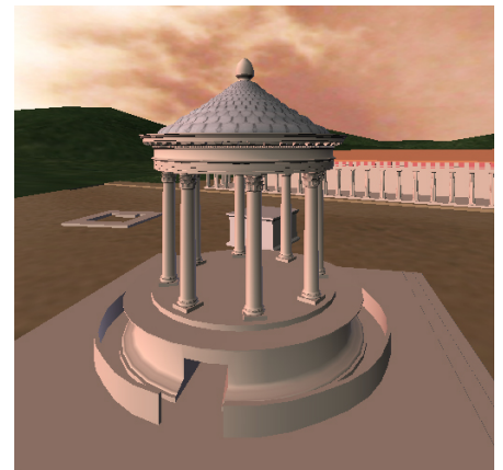
Figure 8: Two different hypotheses for the Tholos monument. Left, the hypothesis of P. Marchetti, and right the hypothesis of M. Pierart. These are snapshots from our VR system. The user can switch between representations interactively.