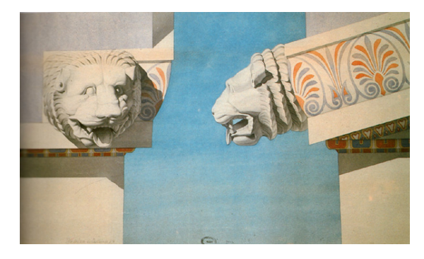
Figure 6: A 19th century watercolor representation of part of the Parthenon. Note the importance of paper grain in the overall aesthetic result.

The above high-level user activity requires seamless interaction methods that will facilitate the users' tasks. Therefore, we are extending the interactive experience to the other senses -such as touch- by developing haptic interfaces so that the virtual environment can be dynamically built by the learner/visitor/scholar/designer in a natural manner (see Figure 5).