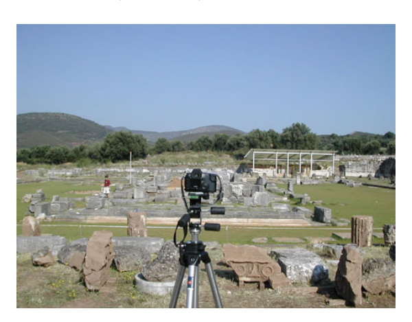
Figure 4: Hundreds of images from at least four different points of view were taken and calibrated in order to create a photorealistic 3D virtual environment of the site.

The process of data acquisition from the above sites involved taking a large number of digital photographs of the sites (Figure 4), which are stitched into panoramas using RE-ALVIZ Stitcher ^{TM} . The resulting panoramas are imported into REALVIZ ImageModeler ^{TM} , which is then used to calibrate the cameras, and create 3D models of the surrounding environments as well as the objects and buildings. Textures are applied either by extracting them using ImageModeler ^{TM} , or by using an automatic approach for projective textures ^{18} . The modelling-from-images techniques used have produced textured polygonal models of the photographed scenes, forming detailed 3D reconstructions of the sites as they stand today.