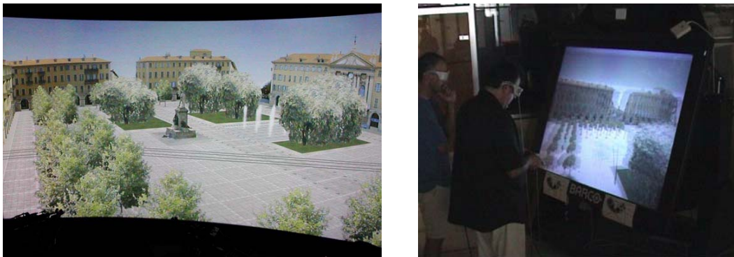
Figure 2: View of the urban planning VE on a curved presentation display (left) and an architect using it on an immersive workbench (right).

The user needs analysis was carried out at the very beginning of the project and led to the definition of the user task scenarios that were used in the evaluation sessions. Usability evaluation forms a central tenet of our evaluation methodology, as it involves observing the users of the VE in order to determine if the VE aids or hinders them in reaching their intended goals. Given the nature of our project, we chose to limit our testing to a small number of users and follow an in-depth qualitative approach. One of the reasons for this is the obvious practical difficulty in evaluations within real-world situations, i.e., getting busy, highly qualified professionals to agree in participating in experimentation, which requires a significant investment in time. Other reasons include the highly experimental nature of the prototypes and the use of innovative and relatively inaccessible equipment (tracked immersive VR displays). We believe that for this project, case studies, where small groups of users are studied in depth, are more useful for gaining insights into the effectiveness and efficiency of our system, and come as a natural continuation to the design process that preceded the evaluation.