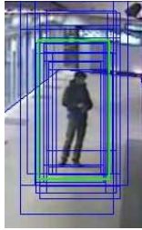
Fig. 1. Example of human detection.

Human Detector People are detected using LBP (Local Binary Pattern) [5] features trained with Adaboost. For training the NICTA database [6] is used, containing 10,000 positive samples. For negative examples, various background images from the NICTA database are used.